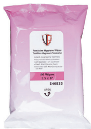
Feminine Hygiene Wipes Count: 40 ct.