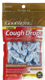
Cough Drops, Sugar-Free Count: 25 ct.