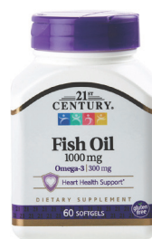
Fish Oil Softgels, 1,000 mg.† Count: 60 ct.