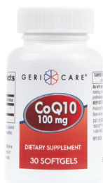
Coenzyme Q-10, 100 mg.† Count: 30 ct.