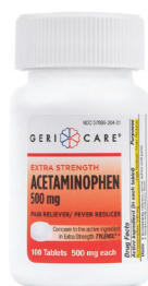
Acetaminophen Extra Strength Tablets, 500 mg. Count: 100 ct.