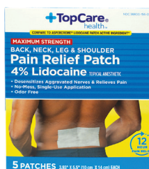
Lidocaine Patch, 4% Count: 5 ct.