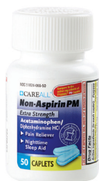
Acetaminophen PM Extra Strength Caplets, 500 mg., 25 mg. Count: 50 ct.