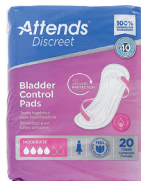
Attends® Discreet Women's Moderate Bladder Control Pad* Count: 20 ct.