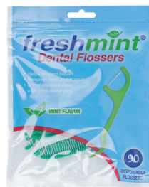
Interdental Flossers Count: 90 ct.