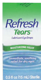
Lubricating Eye Drops, Refresh Tears®, 15 ml. Count: 1 ct.