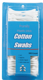
Cotton Swabs Count: 300 ct.