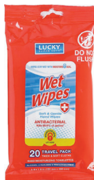
Anti-Bacterial Wet Wipes Count: 20 ct.