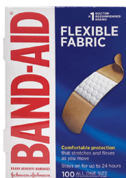
Band-Aids®* Count: 100 ct.