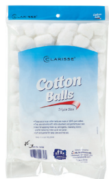
Cotton Balls Count: 100 ct.