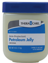
Petroleum Jelly, 4 oz. Count: 1 ct.