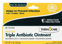
Triple Antibiotic Ointment, 1 oz. Count: 1 ct.