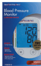
Blood Pressure Monitor, Upper Arm Automatic, Adult (8.6"-11.8") & X-Large Cuff (16.5"-18.8")† Count: 1 ct.