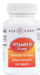
Vitamin D3, 25 mcg.† Count: 100 ct.