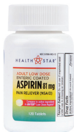
Aspirin, Enteric Coated Tablets, Low Dose, 81 mg. Count: 120 ct.