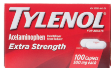
Tylenol® Extra Strength Tablets, 500 mg. Count: 100 ct.