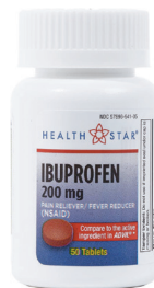
Ibuprofen Tablets, 200 mg. Count: 50 ct.