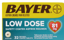
Bayer® Enteric Coated Aspirin, Low Dose, 81 mg. Count: 32 ct.