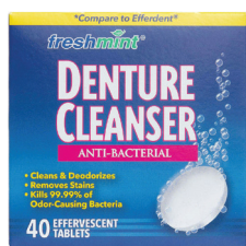
Denture Cleaning Tablets Count: 40 ct.