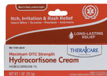
Hydrocortisone Cream, 1%, 1 oz. Count: 1 ct.