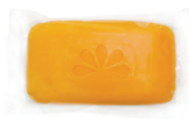
Anti-Bacterial Bar Soap Count: 1 ct.