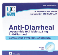
Loperamide Anti-Diarrheal Caplets, 2 mg.* Count: 12 ct.