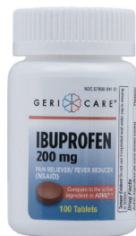
Ibuprofen Tablets, 200 mg. Count: 100 ct.