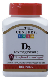
Vitamin D3, 125 mcg.† Count: 100 ct.