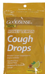
Cough Drops, Honey Lemon Count: 30 ct.