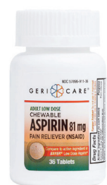
Aspirin Chewables, Low Dose, 81 mg. Count: 36 ct.